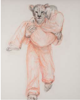
"Pietà" from The Green Blood Bank Oeuvre , Conte and charcoal on Arches paper, 28" x 43".