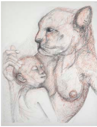
"Tigre Madonna" from The Green Blood Bank Oeuvre , Conte and charcoal on Arches paper, 28" x 43".