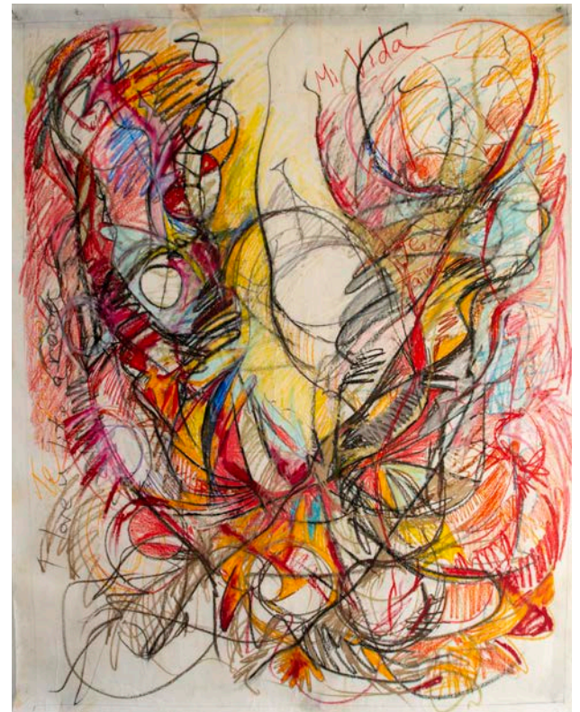
"Mi Vida" from Love Letters Suite , Oil pastels on fiber, 48" x 60".