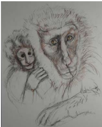
"Madonna and Child" from The Green Blood Bank Oeuvre , Conte and charcoal on Arches paper, 28" x 43".

delicate, ephemeral way as they morph across the divides between human and animal, human and the divine. In her drawings, the outlines of figures are juxtaposed against white backgrounds as though they were already the ghosts of their past selves. The idea of vanishing presence that will become absence is central to Huacuja's meditation on the inhabitants of the Amazon: she makes her figures come to life fully aware that their time might be short. As she states, "We are facing the very real end of a world inhabited by wild creatures as we stand by helplessly and watch Greed devour Beauty; as we stand by and see the Jungle disappear on Earth and in our own selves." In Huacuja's drawings from this series, mother animals clutch their young and tigers emerge as the guardians and enablers of possible communication between animals and humans.