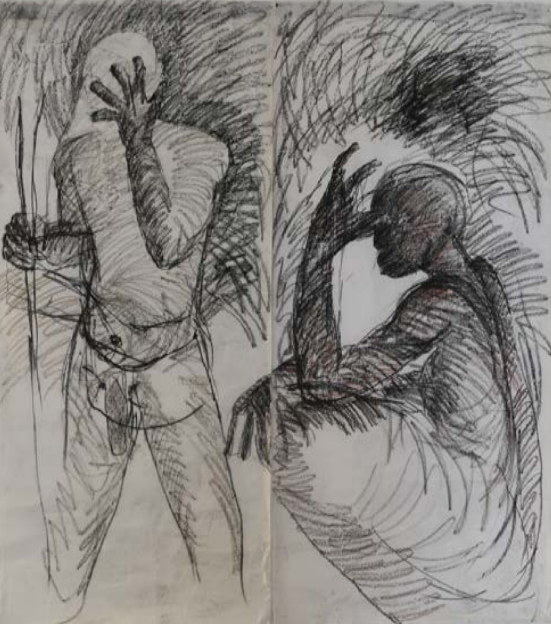
"Refugees," Oil pastels on fabric, (each) 37" x 82".

The universal aspects of migration are the subject of Huacuja's drawing "Refugees," in which she draws the bodies and heads of two migrants, whose gestures speak of sorrow, despair, exhaustion and agony and of the loss of identity that is a part of mass migrations. These two figures once had an identity firmly established by place and people. Now, even their faces have lost form as they seek an unknown new identity that has not yet formed in the liminal space they inhabit as they move from home to the unknown. Huacuja's sharp lines, with their abrupt and jagged movements, enact the emotions that accompany those of her figures—standing and sitting with their hands up to their faces in gestures that express their plight.