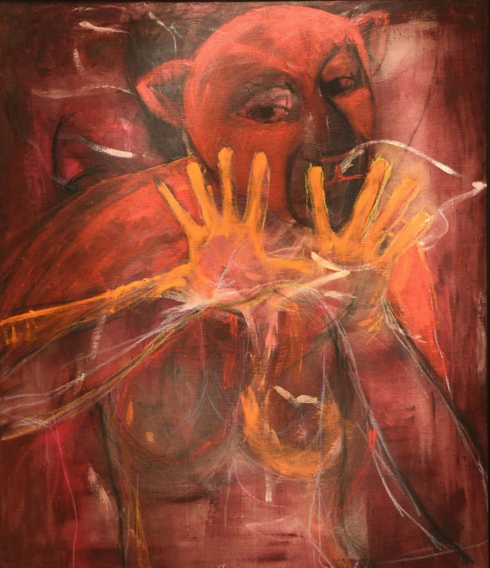
"Tigre Acorralado/ Cornered Tigre," Acrylic on linen, 48" x 42".