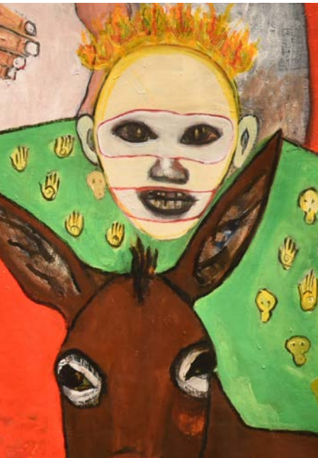
"Ehecatl, dios del viento, creador del mundo/ Ehecatl, God of the Wind, Creator of the World," Acrylic on canvas, 60"x 60".