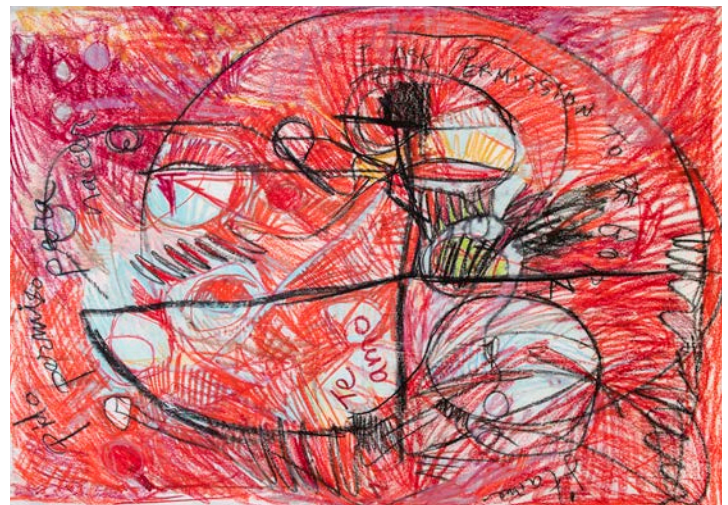
"I Ask Permission to Be Born" from Love Letters Suite , Oil pastels on fiber, 48" x 60".